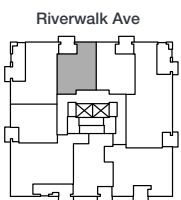
Levels 10 - 11