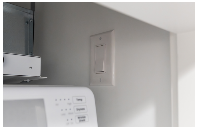
Please keep the booster fan switch on at all times.