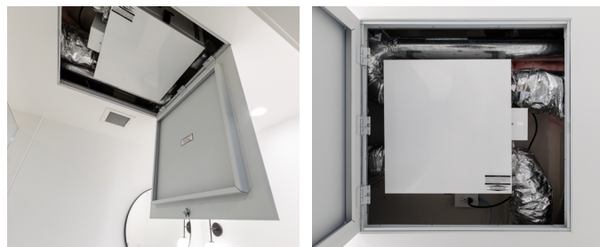
Bathroom ceiling-mounted ERV access

An ERV manages the humidity levels in your home, brings in fresh outdoor air as needed, and cleans your indoor air. To ensure that the ERV can effectively function, it is important to check the filters and clean as needed, in addition to changing the VRF filter. The dirtier a filter is, the harder the ERV must work to pull air through it. This excess strain can cause your unit to malfunction, and it will not be considered a warrantable service due to improper maintenance.