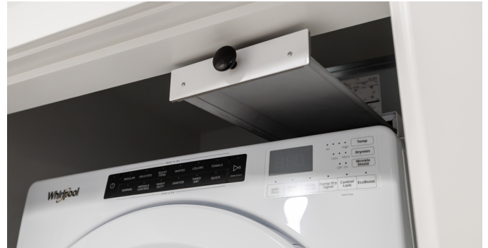
Secondary lint trap

If your booster fan is not operational and you have failed to notify us in an appropriate timeframe, you may be responsible for the cost of the leak remediation.